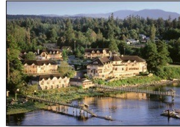
Painters Lodge, Campbell River BC